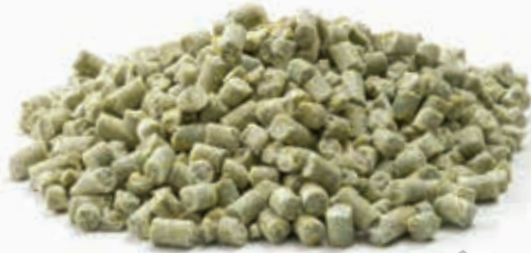
Photo may not be representative of a label-consistent bait placement.